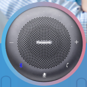
Panasonic Bluetooth and USB Conference Speakerphone

Turn any workspace into an instant conference room.